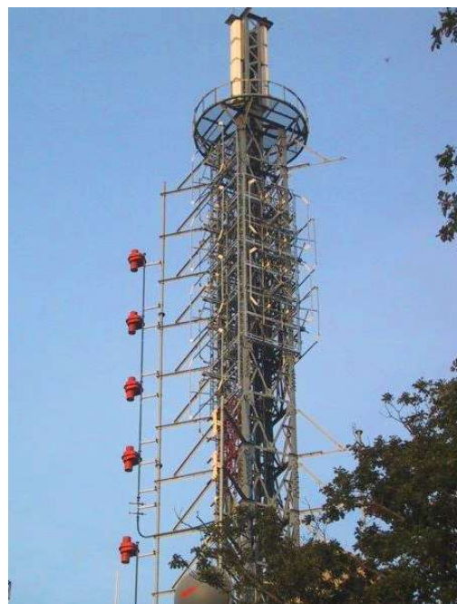
FM CP Dipole Antenna in Mt. Daeryong