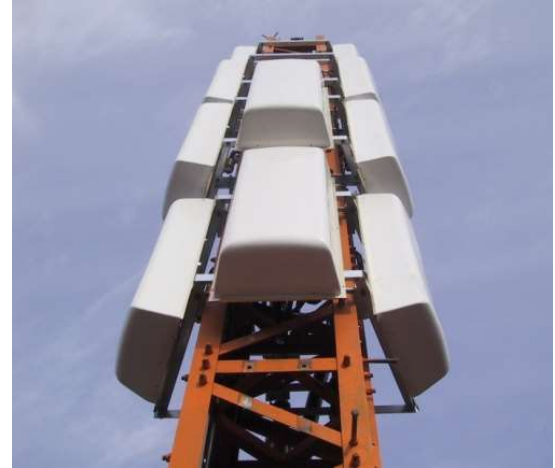
UHF DTV Antenna System in Gwang-gyo Site