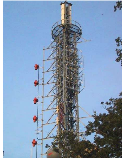
FM CP Dipole Antenna in Mt. Daeryong