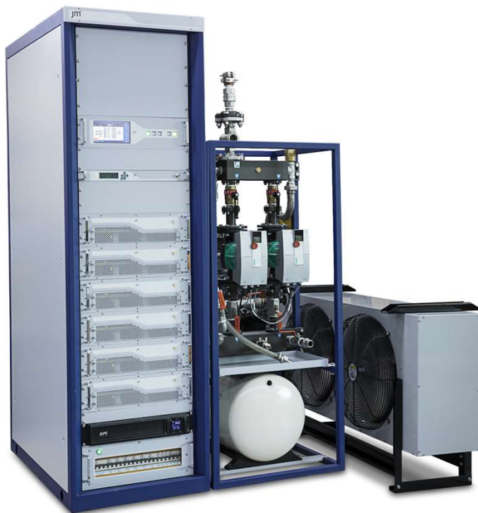
6000W Liquid Cooled DTV Transmitter System